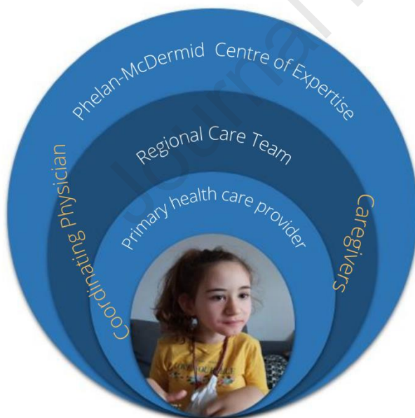
Figure 1. Proposed care network of an individual with PMS, or other genetic neurodevelopmental disorder.

[please insert Figure 1 close to the paragraph above]